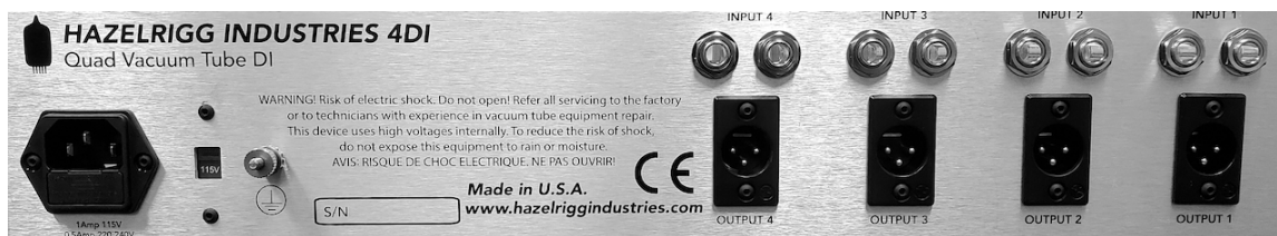
Figure 1. 4DI Rear Panel Connections

Although the vacuum tubes in the 4DI are selected for minimum microphonic response, it is a good practice to avoid mounting locations that subject the 4DI to very high sound or vibration levels. Avoid placing the unit where it is tightly confined. Do not block the cooling holes. The 4DI runs cool, cooler, in fact, than many solid-state devices.